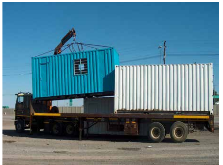
Beaufort West First Container White replace by Blue Container

The fixed and mobile clinics are manned by professional nurses and counsellors, who offer general healthcare testing such as blood pressure, glucose and cholesterol testing, measurement of body mass index, screening for tuberculosis and sexually transmitted infections as well as HIV testing, counselling, condom distribution, education and training.