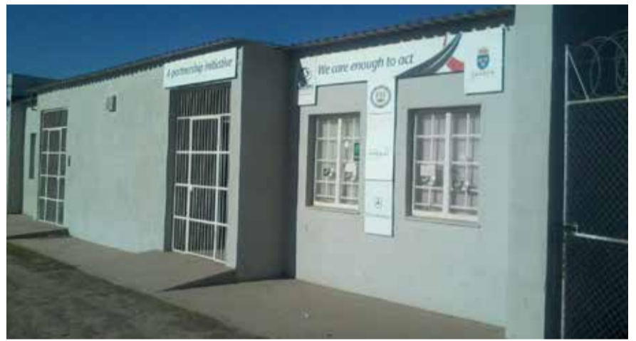
Beaufort West - Moved into building 2005

Counselling and Testing (HCT) service, which made it easier for industry members to get tested and learn more about HIV/AIDS. The HIV counselling offered at TWP’s Mobile HCT is rooted in providing emotional and psychological support.