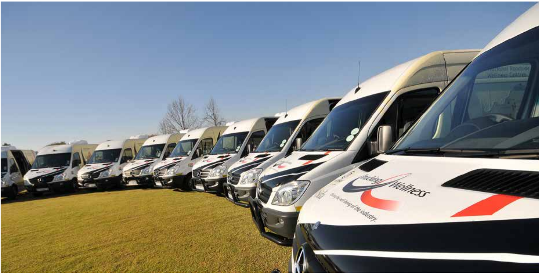
Mobile Launch 2011

Wellness Centres are. Another milestone was when the TWP attended the World AIDS conference in Mexico where they showcased their concept on the international stage.