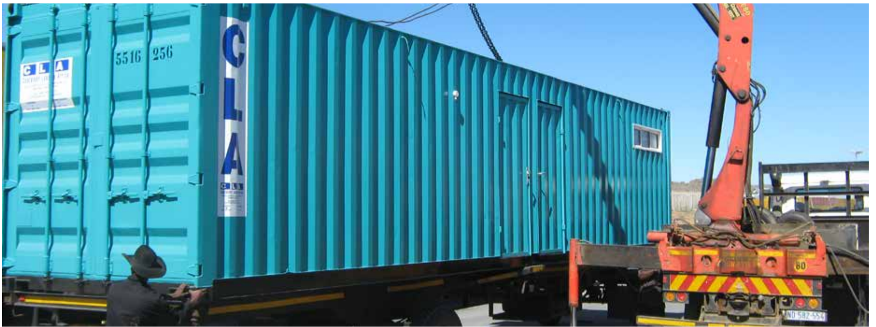
An old shipping container

There was a time when trucking and wellness were two ideas that were not normally associated with one another. If truth be told, the trucking industry has over very many years been known to be, for the most part, susceptible to poor health and, in particular, to HIV/AIDS.