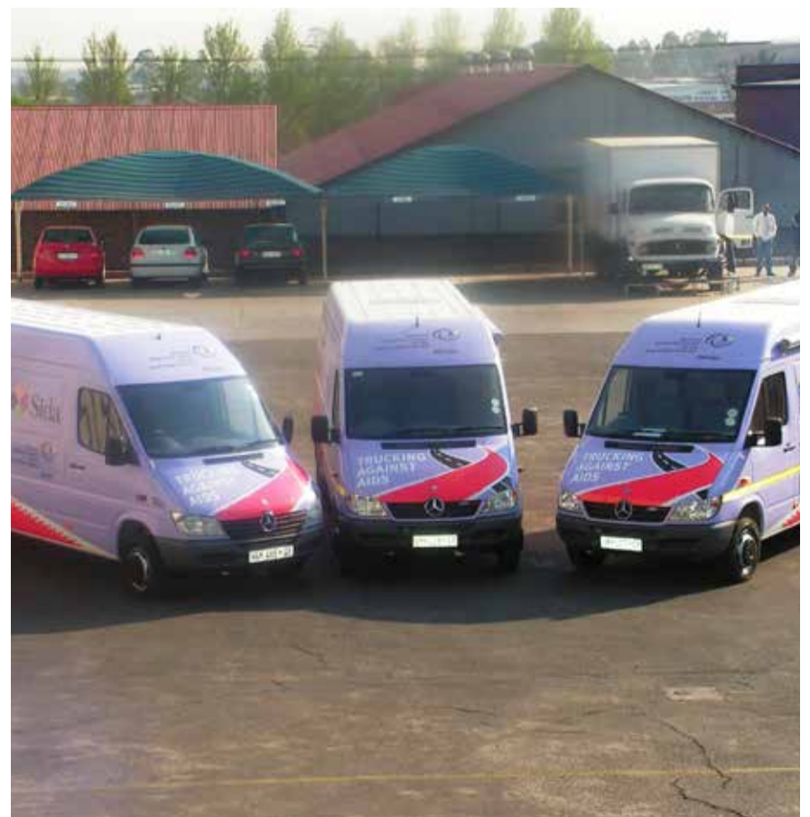
Mobile Launch 2011

path of innovation. The lessons of the past have clearly spelt out that the future of the TWP will continue to be driven by innovation, growth and improved quality of service informed by the ever changing needs of its clients. This exciting journey forward will remain focussed on the prevention, treatment and care of HIV, STIs and other lifestyle diseases.