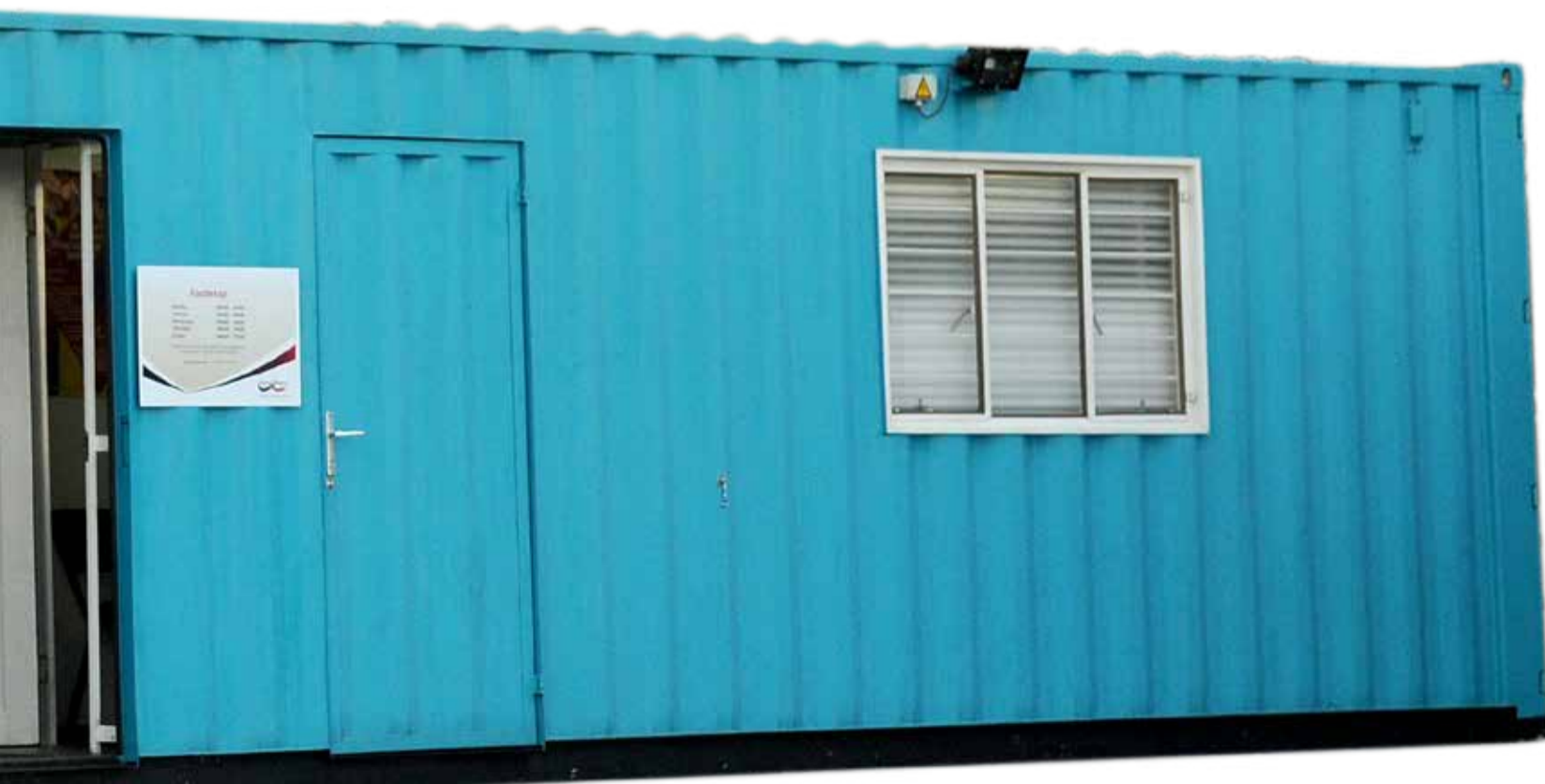
Roodekop - 2011 launch

The fleet of Mobile Wellness Centres was increased with the addition of five Ford Rangers and two Mercedes Benz Vitos.