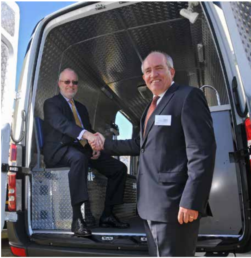
Mobile Launch 2011

CD4 count. The TWP had an opportunity to showcase its work at the 26th International Union Against Sexually Transmitted Infection (IUSTI) Europe Conference on STIs & HIV/AIDS and the 10th BADV Congress, which was held on September 8-10, 2011 in Riga, Latvia.