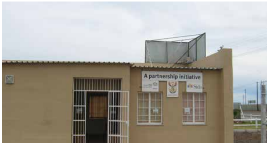
Beaufort West 2005

“The beginning of the decade brought great success which has compelled us to continue providing industry members with new and innovative methods.”